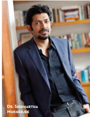
DR. SIDDHARTHA MUKHERJEE

Eudēmonia will be the first wellness summit to measure attendees’ baseline health at an on-site biometric